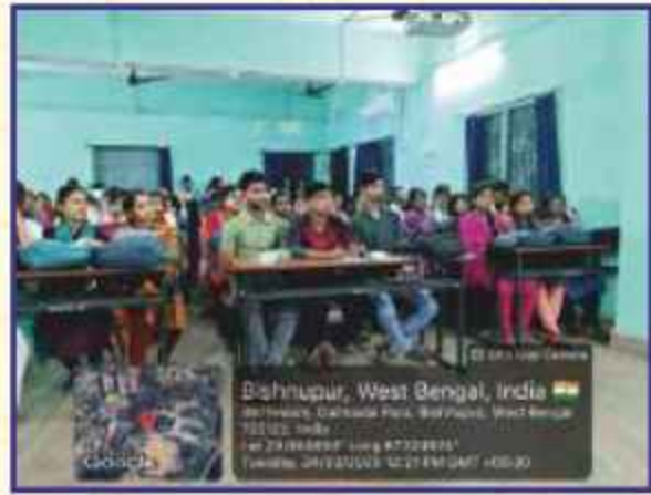
Government-Sponsored Job Training Programme, March 2026