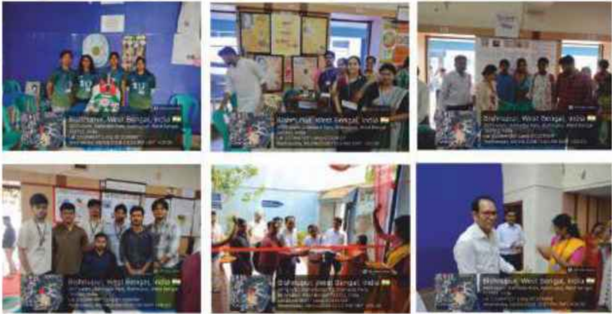
Annual Exhibition, April 2026