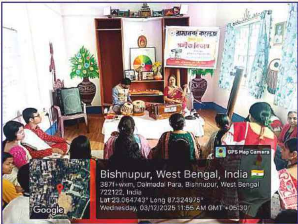
Workshop, Department of Music, December 2025