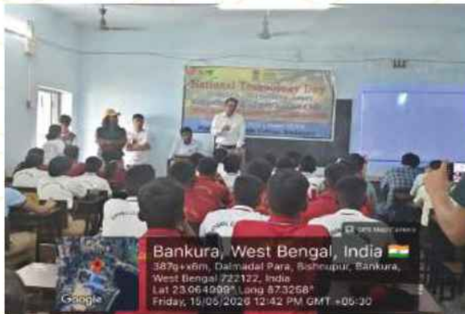
Celebration of National Technology Day, May 2026