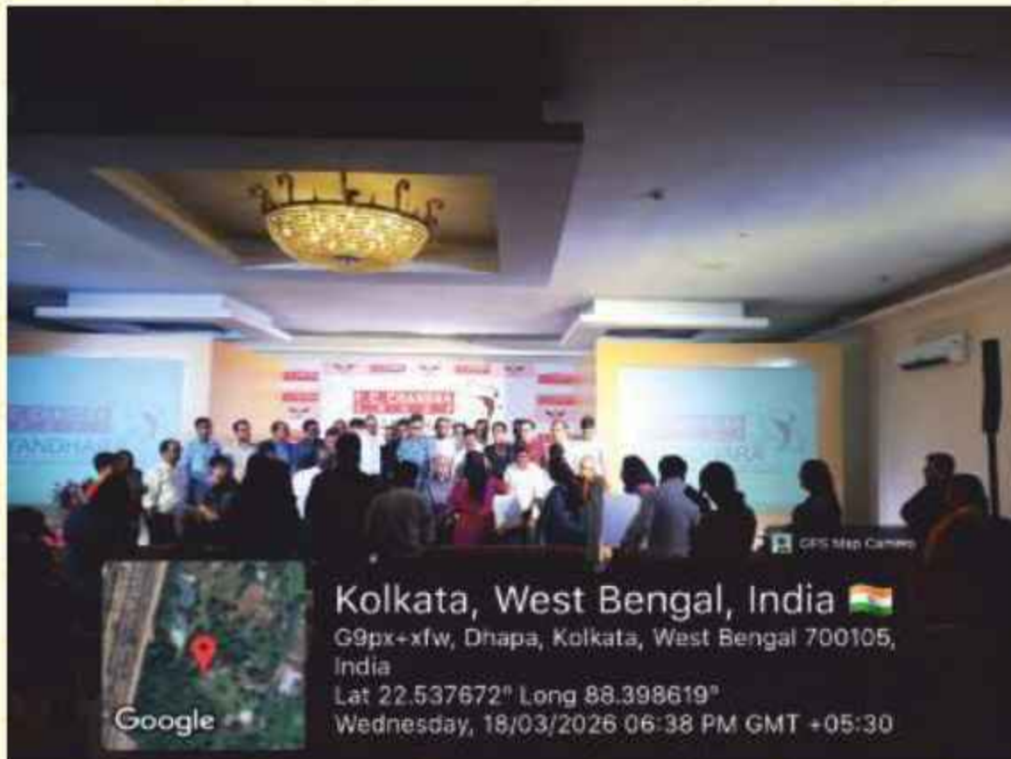
P. C. Chandra Group Grant Award to Ramananda College, March 2026