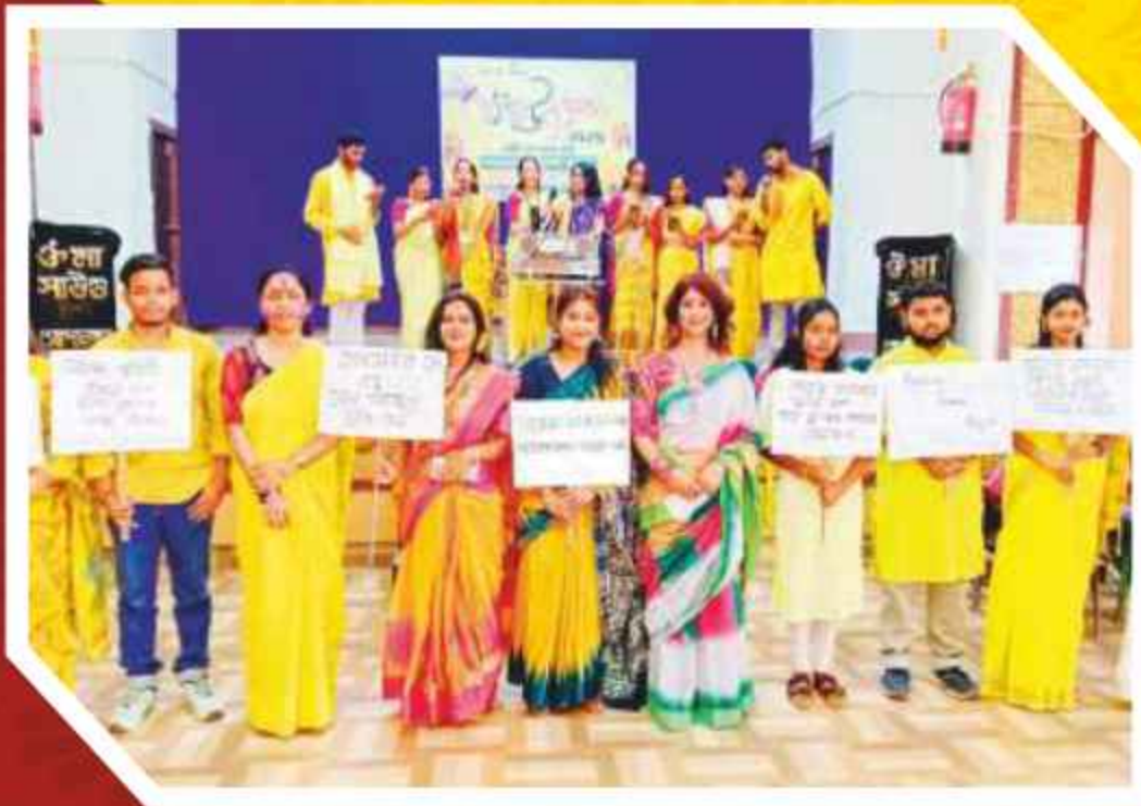
Basanta Utsab Celebrations, April 2026