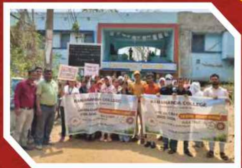
NSS Units, Ramananda College