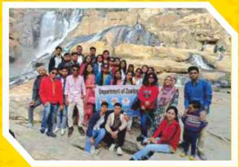
Excursion, Department of Zoology, November 2025