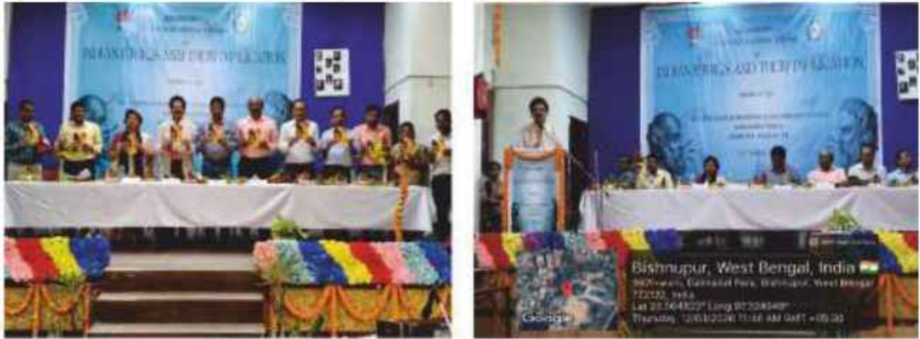
Bhasha Dibas Celebration, February 2026