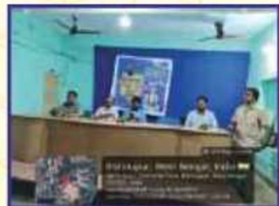
Career Development Programme with ICA, March 2026